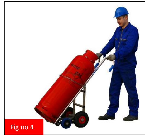
Fig no 4