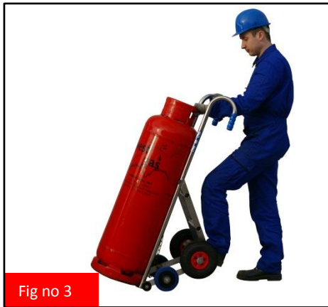
Fig no 3